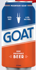
Mountain Goat Goat Goat Cans