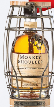
Monkey Shoulder Blended Scotch Whiskey