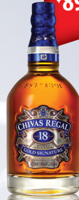
Chivas Regal 18 Year Old Scotch Whisky