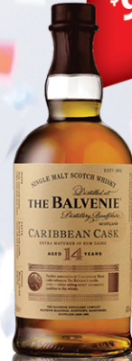
Balvenie 14 Year Old Single Malt Scotch Whisky