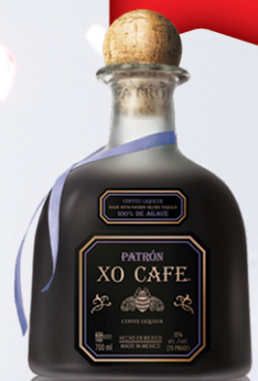
Patrón XO Café