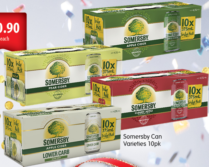
Somersby Can Varieties 10pk