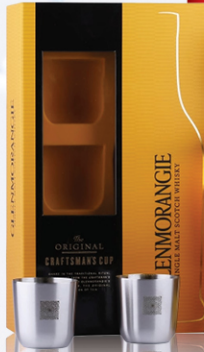
Glenmorangie 10 Year Old Scotch Whisky Gift Packs