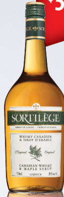
Sortilège Canadian Whiskey & Maple Syrup